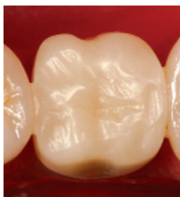
Fig. 1 Preoperative view of the provisional restoration in place.

Fig. 8 shows the immediate post-operative view of the restoration on tooth 19. Fig. 9 shows the immediate post-operative view of the restoration on tooth 30. ■