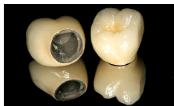
Fig. 6 Final restorations at the laboratory after contouring, texturizing, and glazing.