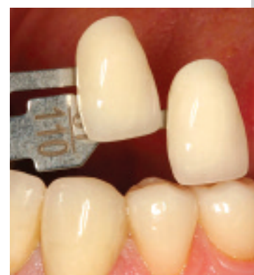
Fig. 2 Take shades for the restorations.