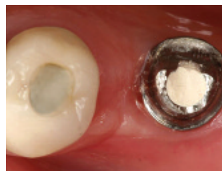
Fig. 3 Implant abutment for tooth 30.