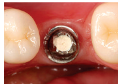
Fig. 4 Implant abutment for tooth 19.