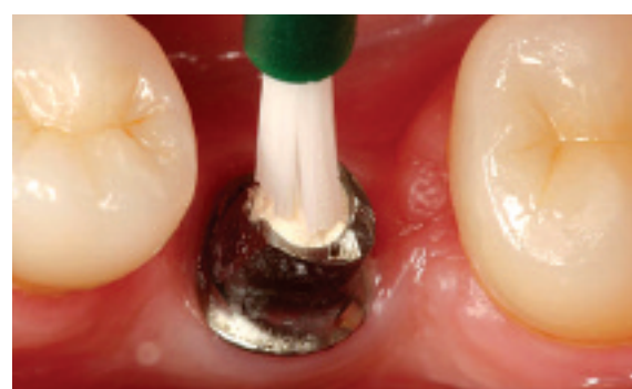
Fig. 7 Paint MultiLink metal primer onto the abutments.