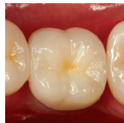
Fig. 8 Immediate post-operative view of the restoration for tooth 19.