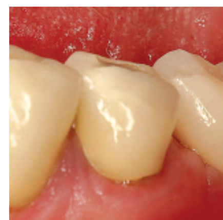
Fig. 9 Immediate post-operative view of the restoration for tooth 30.

implant abutments (Fig. 7) using MultiLink metal primer. Simultaneously, the Multilink Primer A and Primer B are mixed in a well. Note: The primer mix is used to further condition the abutments.